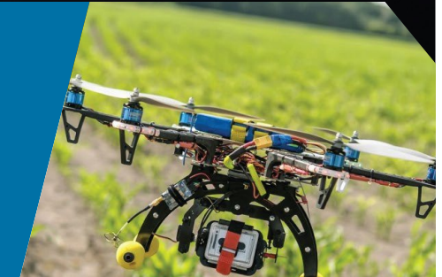
A drone performs a crop survey.

The IEEE Journal on Miniaturization for Air and Space Systems (J-MASS) is a new technical journal devoted to covering the rapidly evolving field of small air and space systems such as drones and small satellites. These platforms offer new, low-cost ways to accomplish a wide range of sensing functions for applications ranging from agriculture to land use and ocean surveys.