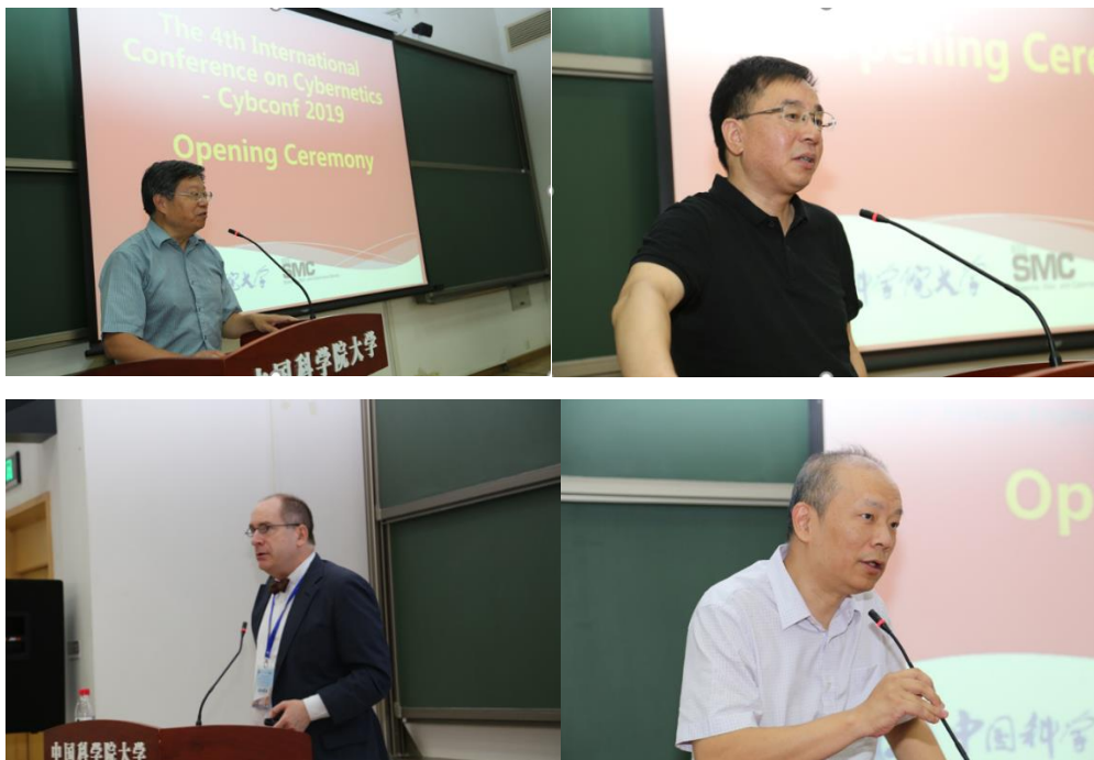
Welcome words from invited guests