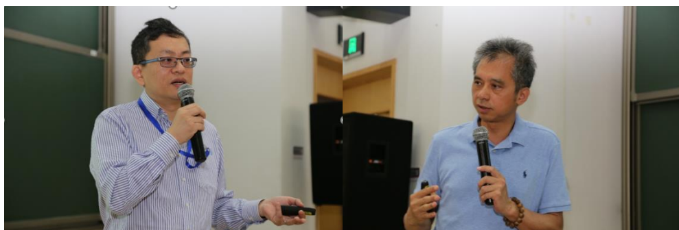
Fig 2. Keynote speakers of Keynote Session 2