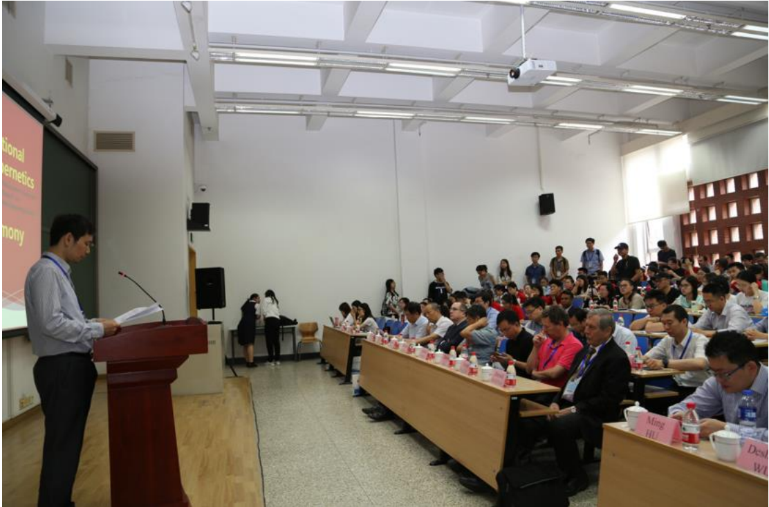
Opening ceremony of Cybconf 2019