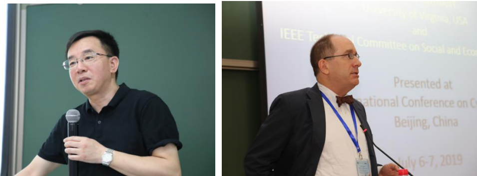
Fig1. Keynote speakers of Keynote Session 1