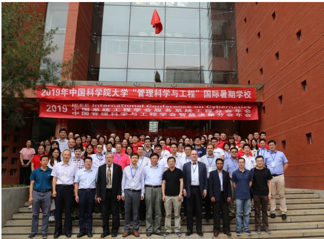
Photograph of all attendees

CYBCONF-2019 is held on July 5 th -7 th at Zhongguancun Campus of University of Chinese Academy of Sciences (UCAS). It is sponsored by IEEE Systems, Man, and Cybernetics Society (SMCS), organized by University of Chinese Academy of Science (UCAS), and supported by IEEE SMC Technical Committees on Social and Economic Security and IEEE Systems Council Analytics and Risk Technical Committee, and in cooperation with the School of Economics and Management of UCAS, the International College of UCAS, Center for Environmental Economics of UCAS. The theme of the conference was “Risk Analysis and decision intelligence for complex management problems”.