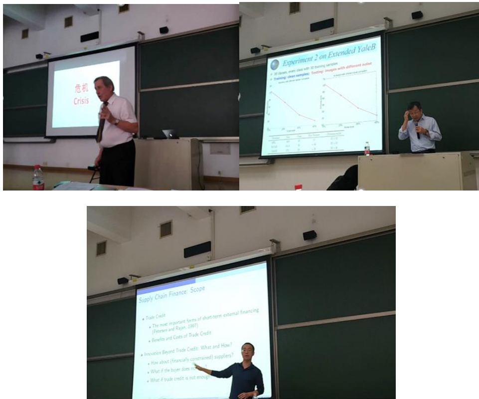
Fig 3. Keynote speakers of the Keynote session 3