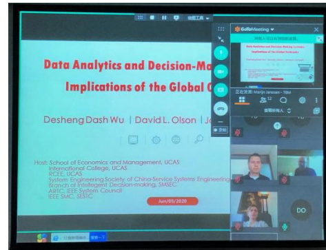
Experts gave their opinions